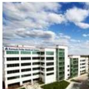
Kaweah Delta Medical Center 400 W Mineral King Ave Visalia, CA 93291