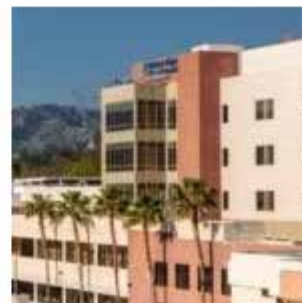
Henry Mayo Newhall Hospital 23845 McBean Pkwy Valencia, CA 91355