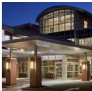
Wentworth-Douglass Hospital 789 Central Ave Dover, NH 03820