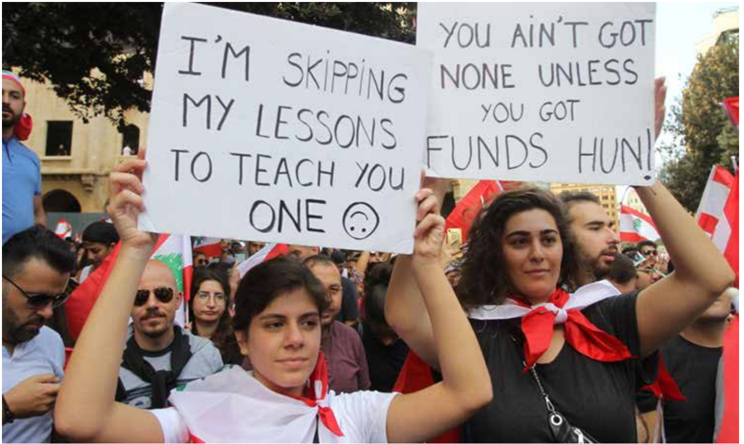
Above, below, and upper photo next page: protests and civil unrest that started over a year ago. Pictures represent young professionals or students taking the streets, AUBMC physicians joining those protests, medical students also joining (and wearing masks prior to 2020!). The last protest picture shows how "female-dominated" these protests were, led by strong women.