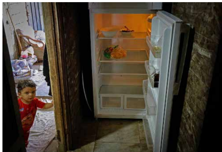
Empty fridges, reflecting the severity of the hyperinflation and the subsequent famine.

The situation is even more dire for refugees. Lebanese is host to the second-largest Syrian refugee population and third largest Palestinian refugee population in the world. This population has increased in the last few years, partly due to the influx of over-45,000 'twice-refugee' Palestinians, once settled in Syria, fleeing to Lebanon to escape the civil war (1). Unable to be employed as a result of their refugee status, most do not have access to either public or private health coverage. Instead, they depend